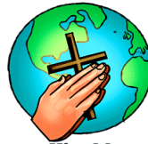
World Mission Sunday

World Mission Sunday is on October 21/22. This is a worldwide collection for the missionary church and it is our opportunity to assist at-need Catholic Communities globally. Offerings are combined with offerings from other Catholics around the world and distributed to missions and dioceses. We are called to share from our abundance with those less fortunate who lack the basic essentials to know, love and praise God. Thank you for your support of this important work.