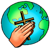
World Mission Sunday

The second collection for the World Mission Sunday takes place next weekend of October 19/20. This is a worldwide collection for missionary church that provides emergency aid when disasters strike, cares for refugees in war-torn nations, provides rural health clinics and transportation for priests, catechists, religious and lay pastoral workers. It provides financial support for the daily needs of all missionaries. Please pray for the missions and be generous on World Mission Sunday.