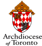
Archdiocese of Toronto

The Annual Weekend Attendance Count by the Archdiocese of Toronto will take place on the weekends of October 19/20 and October 26/27. A headcount survey will be conducted on these two weekends to help provide an accurate profile of Mass attendance in the archdiocese. Thank you for your cooperation. Durante i fine settimana del 19 e 20 ottobre e 26 e 27 ottobre, la nostra parrocchia parteciperà all' annuale contabilità, progetto dell'Arcidiocesi di Toronto. In questi due weekends, un sondaggio sarà condotto da un contabile, che fornirà un profilo accurato di tutte le presenze alle Messe Domenicali In tutta l'Arcidiocesi. Grazie per la vostra collaborazione.